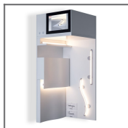
Display P230-90083M Ref: 90083M